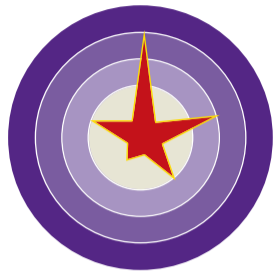
alprazolam 0,5 mg Xanax®