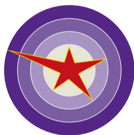
flunitrazepam 4 mg Rohypnol®