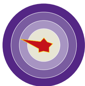
zolpidem 10 mg Stilnox®