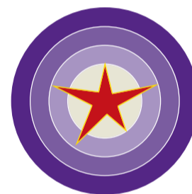
ketazolam 45 mg