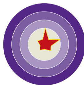
temazepam 10 mg Normison®