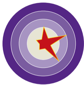
clobazam 20 mg Likozam®, Urbanyl®