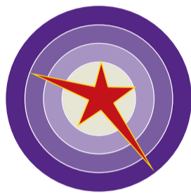
clonazepam 2 mg Ritrovil®