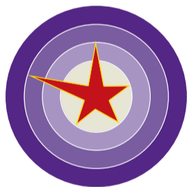
loprazolam 2 mg Havlane®