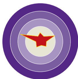
zopiclone 7,5 mg Imovane®