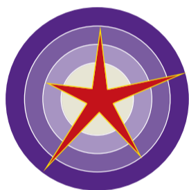
diazepam 10 mg Valium®